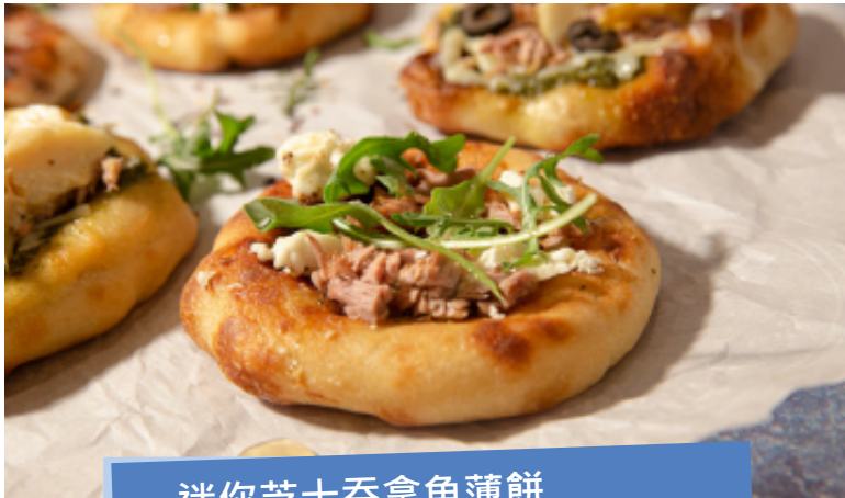
迷你芝士吞拿魚薄餅 Mini Cheese and Tuna Pizza